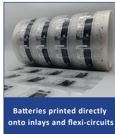
Batteries printed directly onto inlays and flexi-circuits