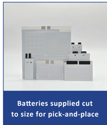
Batteries supplied cut to size for pick-and-place