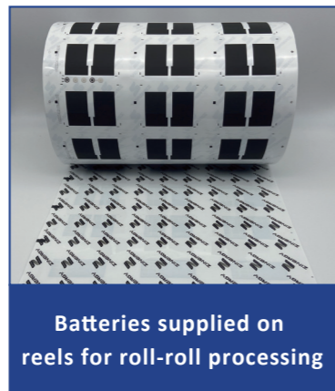
Batteries supplied on reels for roll-roll processing